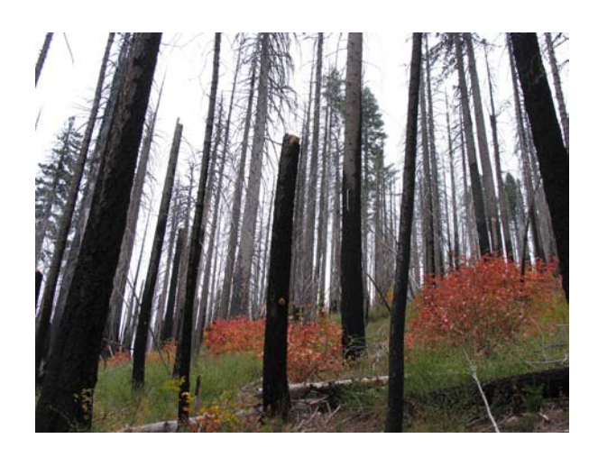
Fig. 6. Snag forest habitat increases the Spotted Owl's small mammal prey and provides foraging habitat for Spotted Owls.

Recent scientific evidence regarding spotted owls in northwestern California and in Oregon found that stable or positive trends in survival and reproduction depended upon significant patches (generally between one-third and two-thirds of the core area) of habitat consistent with high-intensity post-fire effects (e.g., native shrub patches, snags, and large downed logs) in their territories because this habitat is suitable for a key owl prey species, the Dusky-footed Woodrat (Franklin et al. 2000, Olson et al. 2004). This habitat is not mimicked by logging, which removes snags and prevents recruitment of large downed