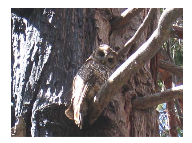
Fig. 7. A California Spotted Owl roosting in a burned area within the McNally fire, Sequoia National Forest.

Interestingly, over four years of study in three fire areas, only one Barred owl was found within burned forests, while many were found just outside the fire perimeter