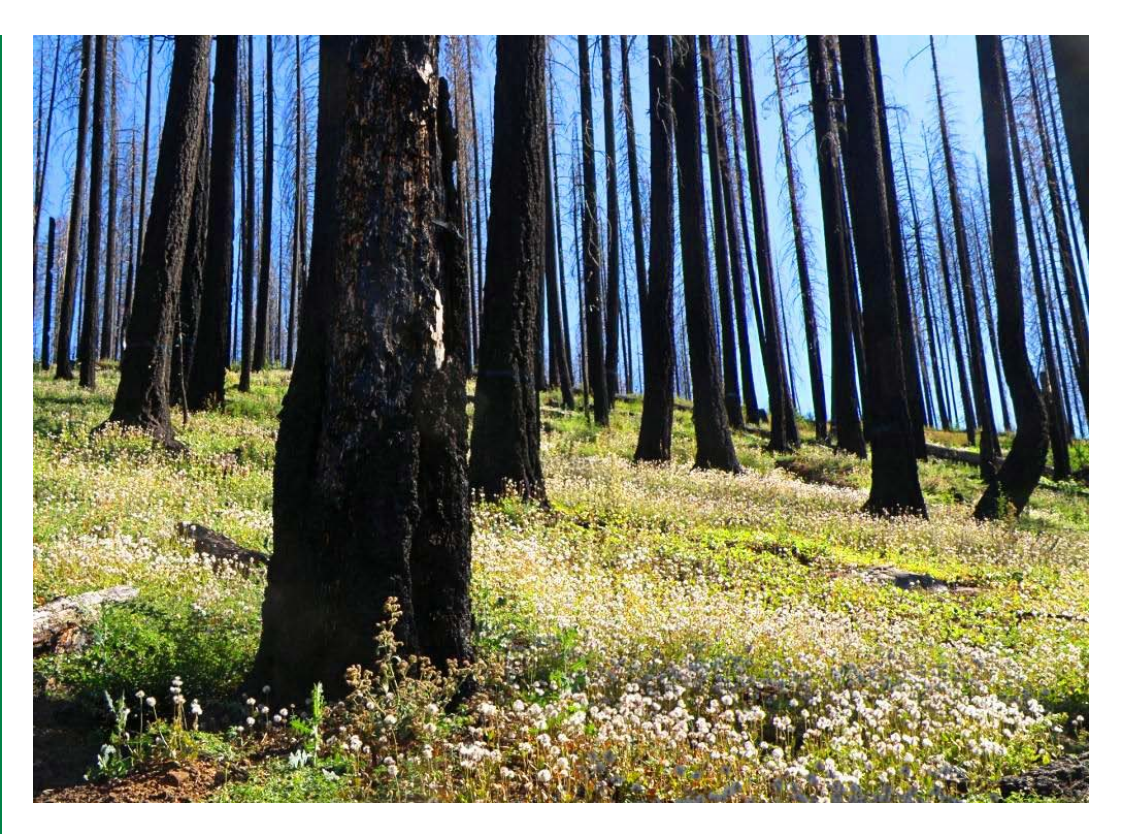
Fig. 10. A recent snag forest patch in the Sierra Nevada.