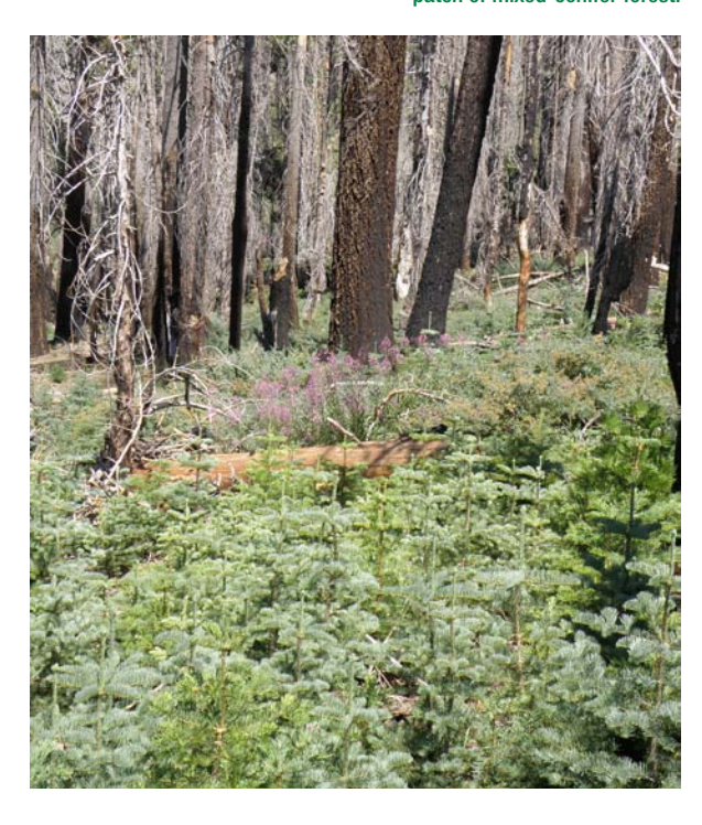
Fig. 9. Natural conifer regeneration in an area of nearly 100% mortality from fire.