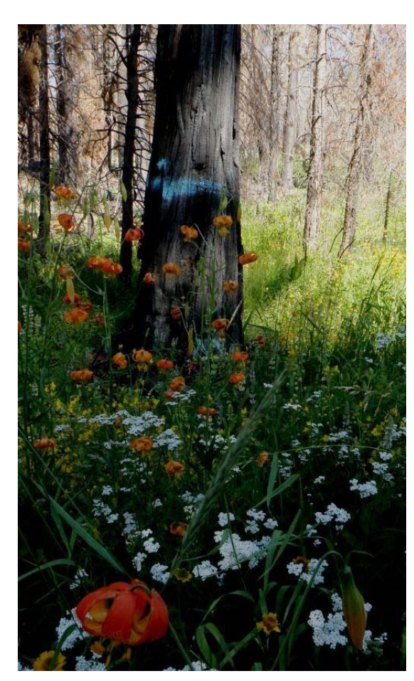
Fig. 2. Post-fire snag tree marked for logging.

created by high-intensity fire will be put at risk of extinction.