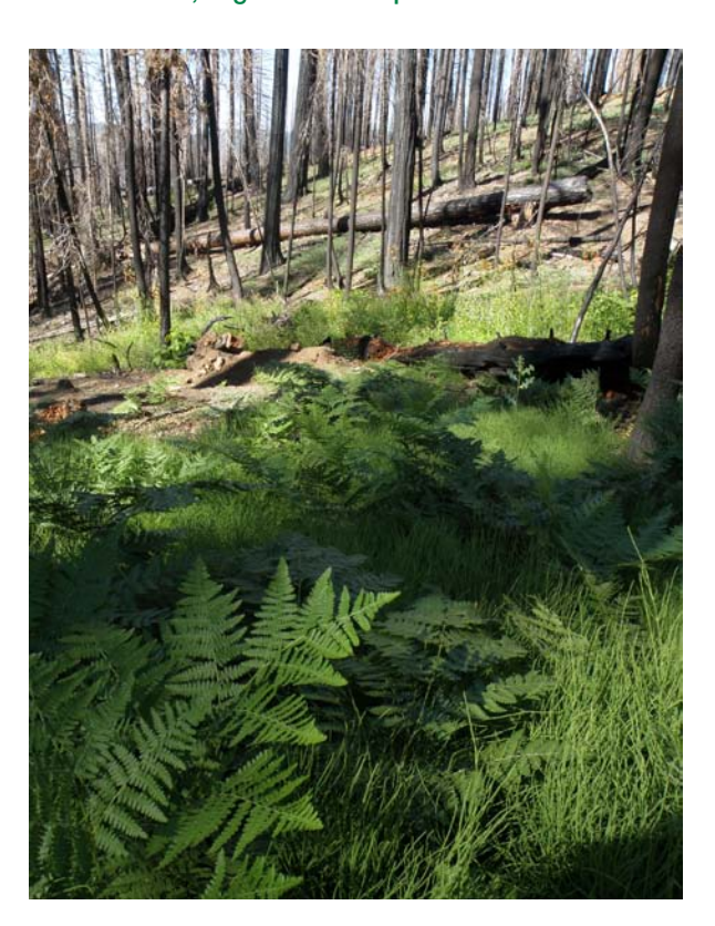
Fig. 13. Understory vegetation in a recent snag forest patch.

The living and dead plant material in a forest is called biomass. This includes everything from the small diameter branches, trees, and shrubs up to the old-growth trees. Today we are seeing increasing aggressive calls – mostly from the timber industry and their political allies - to remove biomass from the forest ostensibly to reduce fire effects. This biomass logging removes trees from the forest to be burned in energy production facilities. However, as discussed above, we remain in a major fire deficit, and snag forest habitat, created by patches of high-intensity wildland fire, is one of the rarest and most endangered habitat types in western U.S. conifer forests; and it is also one of the most ecologically important and biodiverse forest habitat types. Forest management policies designed to further reduce this imperiled habitat would further exacerbate its current deficit, which is