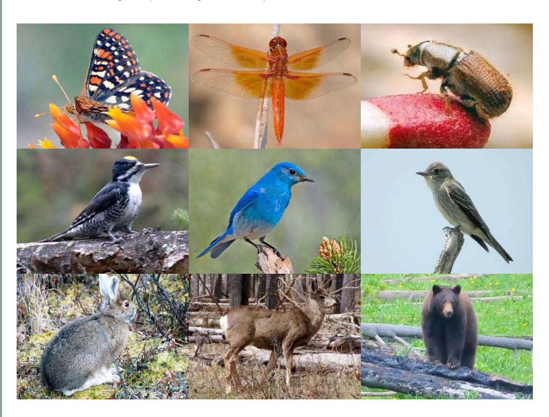
The Myth of "Catastrophic" Wildfire

There is strong consensus among ecologists that high-intensity fire, and resulting snag forest habitat, is something that must be preserved and facilitated, not prevented or destroyed. Lindenmayer et al. (2004) noted the following with regard to wildland fire: "...natural disturbances are key ecosystem processes rather than ecological disasters that require human repair. Recent ecological paradigms emphasize the dynamic, nonequilibrial nature of ecological systems in which disturbance is a normal feature... and how natural disturbance regimes and the maintenance of biodiversity and productivity are interrelated..." Smucker et al. (2005) concluded: "Because different bird species responded positively to different fire severities, our results suggest a need to manage public lands for the maintenance of all kinds of fires, not just the low-severity, understory burns..." Kotliar et al. (2007) observed that the results of their study "demonstrated that many species tolerate or capitalize on the ecological changes resulting from severe fires...", and concluded that: "Fire management that includes a broad range of natural variability (Allen et al. 2002), including areas of severe fire, is more likely to preserve a broad range of ecological functions than restoration objectives based on narrowly defined historic fire regimes (Schoennagel et al. 2004)."