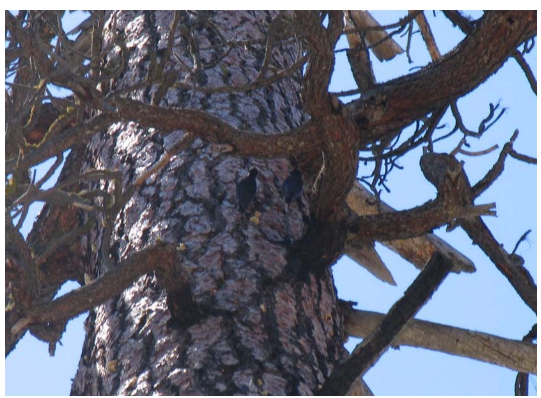
Fig. 11. Black-backed Woodpeckers (center of image) foraging on a large snag.

Due in large part to the combined effects of fire suppression and post-fire logging, large snags (dead trees) are currently in severe deficit, contrary to popular belief. For example, recent U.S. Forest Service Forest Inventory and Analysis (FIA) data, using 3,542 fixed plots throughout California, shows that there are less than 2 large snags per acre in all forested areas (Christensen et al. 2008). The Sierra Nevada Forest Plan Amendment recommends having at least 3-6 large snags per acre to provide minimum habitat for the needs of the many wildlife species that depend upon large snags for nesting and foraging (USDA 2001, 2004). Some species need even higher densities of large snags, such as the California Spotted Owl, which prefers to have at least 20 square feet per acre of basal area in large snags (about 6-8 large snags per acre) to maintain habitat for its small mammal prey (Verner et al. 1992). Other species require much higher densities of large snags, such as the Hairy Woodpecker and Black-backed Woodpecker (Hanson 2007a, Hanson and North 2008).