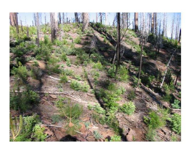
Fig. 8. Natural conifer regeneration in a high-intensity patch of mixed-conifer forest.

In the few places wherein post-fire conifer regeneration does not quickly occur, these areas provide important montane chaparral habitat, which has declined due to fire suppression (Nagel and Taylor 2005). As noted earlier, montane chaparral provides key habitat for a variety for shrub-dwelling species like the Snowshoe Hare and the Blue Grouse, which nests and forages within the shrub growth. The Dusky-footed Woodrat also inhabits these areas, which in turn provides food for the Spotted Owl. Likewise, ungulates, such as deer and elk, forage upon the shrubs, and their predators