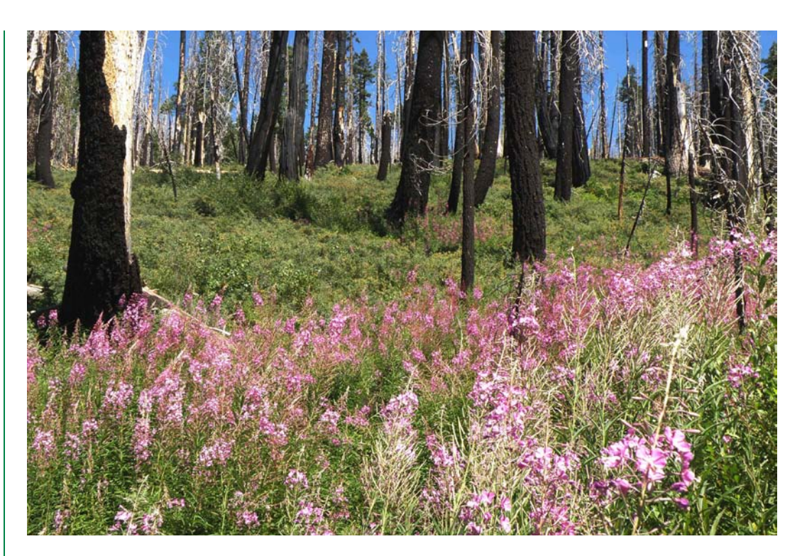
Figure 1. Snag forest habitat in a mature mixed-conifer forest.

In snag forest habitat, countless species of flying insects are attracted to the wealth of flowering shrubs which propagate after stand-transforming fire — bees, dragonflies, butterflies, and flying beetles. Many colorful species of birds, such as the iridescent blue Mountain Bluebird, nest and forage in snag forest habitat to feed upon the flying insects. In order to feed upon the larvae of bark beetles and wood-boring beetles in fire-killed trees, woodpeckers colonize snag forest habitat shortly after the fire, excavating nest cavities in large snags. The woodpeckers make new nest holes each year, leaving the old ones to be used as nests by various species of songbirds. Many rare and imperiled bat species roost in old woodpecker cavities in large snags, and feed upon the flying insects at dusk. Small mammals, such as snowshoe hares and woodrats, create dens in the shrub patches and large downed logs, and raptors, such as the Spotted Owl, benefit from the increase in the abundance of their prey. Deer and elk browse upon the vigorous new plant growth that follows stand-transforming fire, and bears and wolves benefit from the increased abundance of their prey as well. A number of native wildlife species, such as the Black-backed Woodpecker, are essentially restricted to snag forest habitat for nesting and foraging. Without a continuous supply of this habitat, they won't survive.