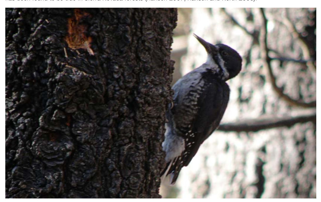
Fig. 5. Black-backed Woodpeckers are just one of the many wildlife species threatened by the loss of snag forest habitat due to fire suppression and "salvage" logging.

Black-backed Woodpeckers are strongly associated with large, unlogged high-intensity patches in areas that were mature/old-growth, closed-canopy forest prior to the fire (which ensures many large snags) (Hutto 1995, Saab et al. 2002, Saab et al. 2004, Russell et al. 2007, Hanson and North 2008, Hutto 2008, Vierling et al. 2008). Pre-fire thinning that reduces the density of mature trees can render habitat unsuitable for Black-backeds even if the area later experiences high-intensity fire, due to a reduction in the potential density of large snags caused by the earlier thinning (Hutto 2008). After approximately 5-6 years, when their bark beetle food source begins to decline and nest predators begin to recolonize the burn area, Black-backed Woodpeckers must find a new large, unlogged high-intensity patch in mature forest to maintain their populations (Hutto 1995, Saab et al. 2004). For these reasons, this species depends upon a continuously replenished supply of high-intensity burn areas (Hutto 1995).